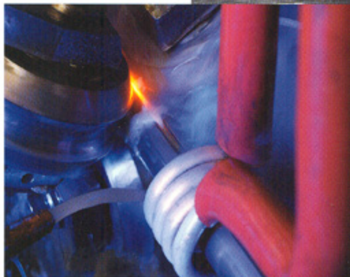
High frequency electric resistance welding forms a strong, smooth, undetectable bond on the plated piece.

This means you can save approximately 20 to 30 percent net in the cost of your plated part with our Quality Premium Surface Tubing—a bottom line difference that makes it worth your while to contact us for all the money-saving details.